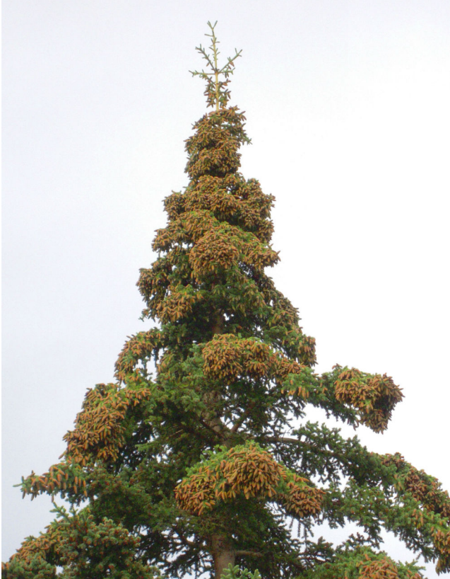
White spruce bearing heavy cone crop at the Kenai National Wildlife Refuge's Visitor Center, August 12, 2014.

Peer out the window or take a walk around the neighborhood asking yourself if the spruce trees bear an unusually large load of cones this summer. I do not know of anyone who keeps track of spruce cone crops locally, but this appears to be a mast year.