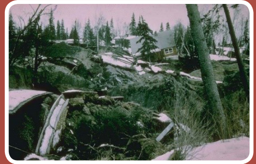
Landslide damage, 1964 Great Alaska Earthquake